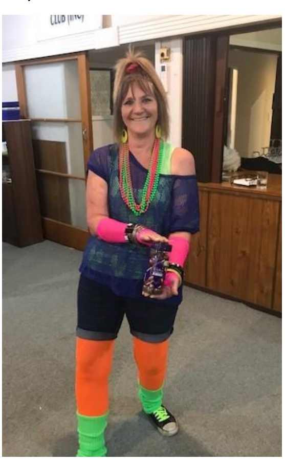
Much more colourful!

He said how hard it was to judge because everyone was so well dressed up. That sounded like a plea for more money to perform his job successfully. Well, he could hardly have got less!