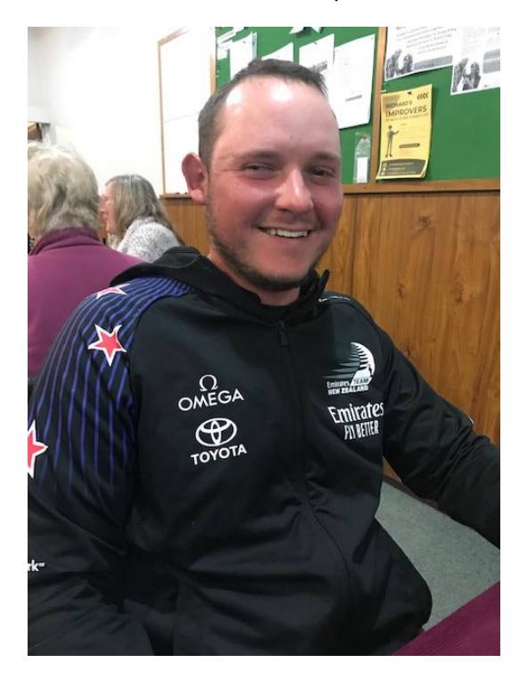
A pretty happy one, too.